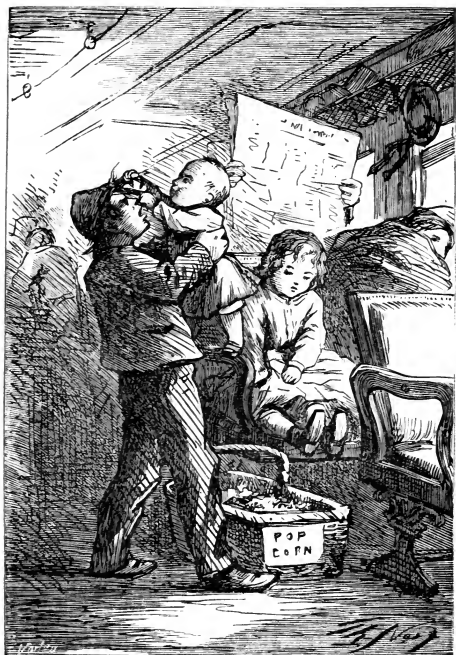
DOTTY IN THE CARS. Page 44.